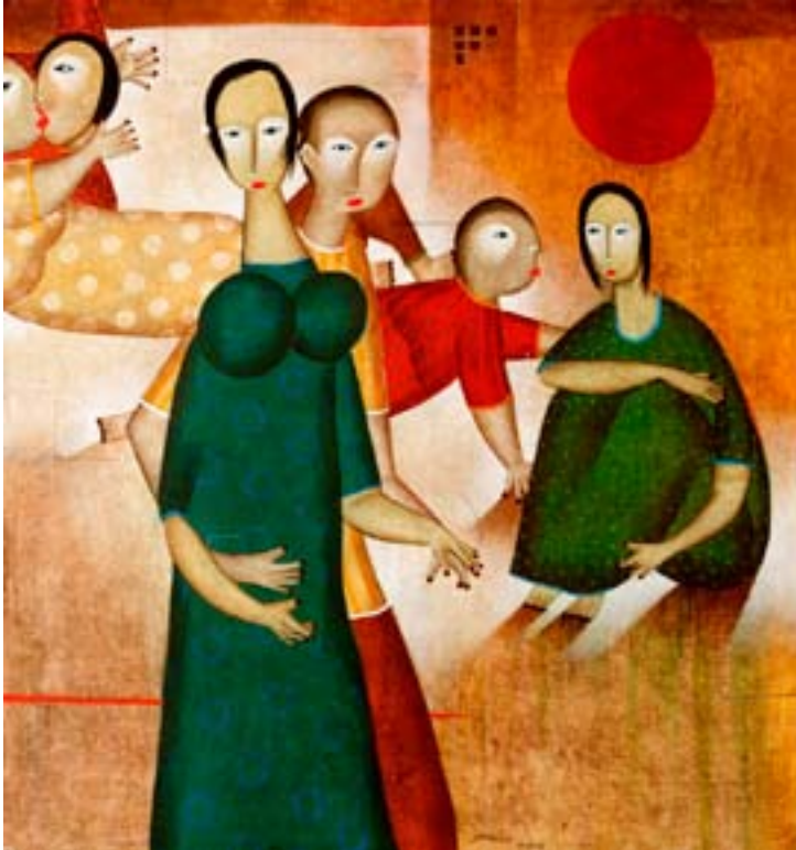
Kadal Melet , 2008, acrylic on canvas, 140 x 130 cm.