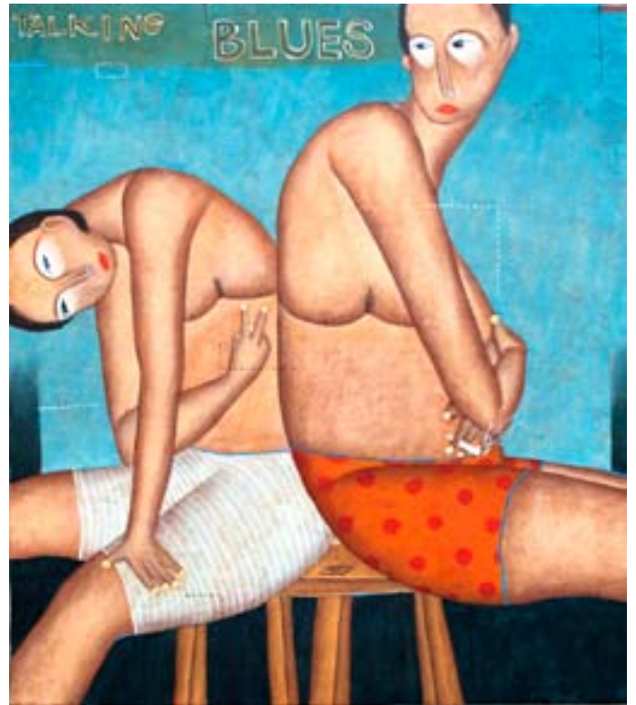
Rival , 2010, acrylic on canvas, 80 x 90 cm.

Seeing Palguna's works at a glance is like reading the artist's diary, honesty told in simple visual language. Palguna feature visuals that are easily chewed up and very close to our daily lives. Almost all of Palguna's works feature experiences from his personal life, with values from his encounters with both his closest circle and the surrounding environmental aspects. Those images are featured through the statues and paintings which are composed by changing their figurative shapes into cubistic patterns. Palguna presents figures, animals and landscape in a supple and chubby manner, bringing forth a witty impression displayed in clumsy and coquette postures.